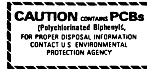
Mark M S

Note: Labels with these markings may be obtained from the On-site Hazardous Waste Contractor (OHWC) at 8-7804 or EH&S at 8-5523.